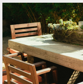
Wooden outdoor furniture